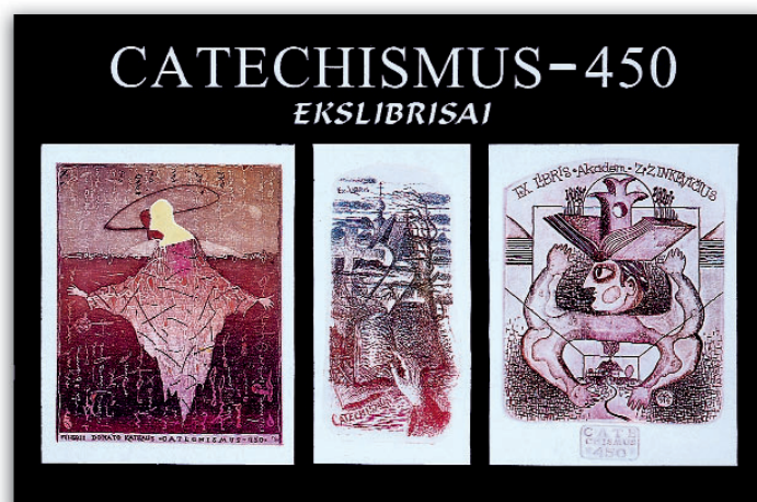
Exlibris-Katalog zum Mažvydas-Jubiläum in Litauen, 1997 Catalogue of Plates to mark the Mazvydas anniversary in Lithuania, 1997

The Eastern Europe Department was one of a number of new Staatsbibliothek sections founded after 1945. It was formally created in Marburg in 1950, to address a growing public need for information and to provide an adequate range of specialist literature to those working in the burgeoning field of Eastern European studies. ■ The Preußische Staatsbibliothek (Prussian State Library) already held considerable stocks of Eastern European literature, most of it in Slavic languages. In the 1950s, the West Berlin library systematically acquired early and modern literature from and about Eastern Europe, and succeeded in considerably augmenting its stocks. ■ In East Berlin, the Deutsche Staatsbibliothek's (German State Library's) collection of Eastern European literature is particularly impressive, due for the most part to its close ties with Eastern European countries. Volumes can now be borrowed from both Staatsbibliothek sites. ■ Since 1998, the Eastern Europe Department and the Department of Early Printed Books have been jointly responsible for the special collection focus "Slavic Languages and Literature (including Folklore)" – a project supported by the Deutsche Forschungsgemeinschaft. For decades now, the department has also placed special emphasis on the acquisition of legal documents from and about Eastern Europe.