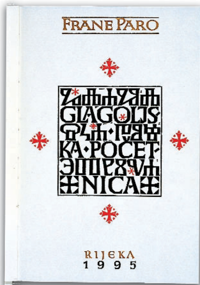
Kroatisch-glagolitische Fibel, Rijeka 1995 Croatian Glagolitic Primer, Rijeka 1995